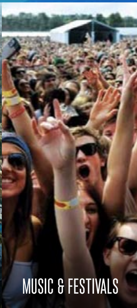
MUSIC & FESTIVALS