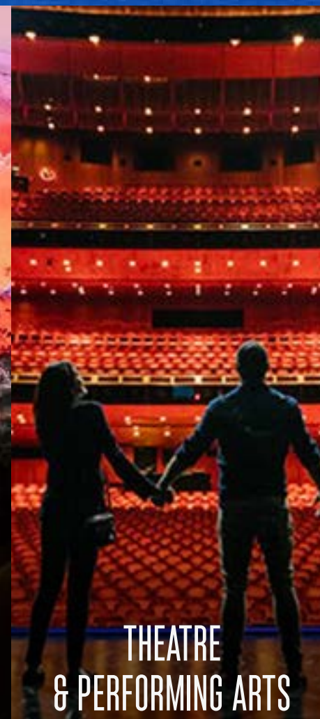
THEATRE & PERFORMING ARTS