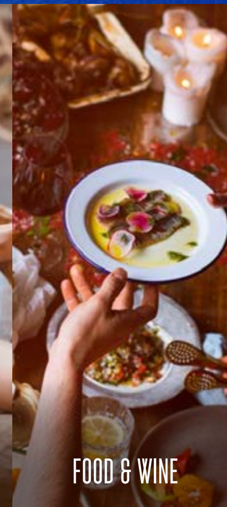
FOOD & WINE