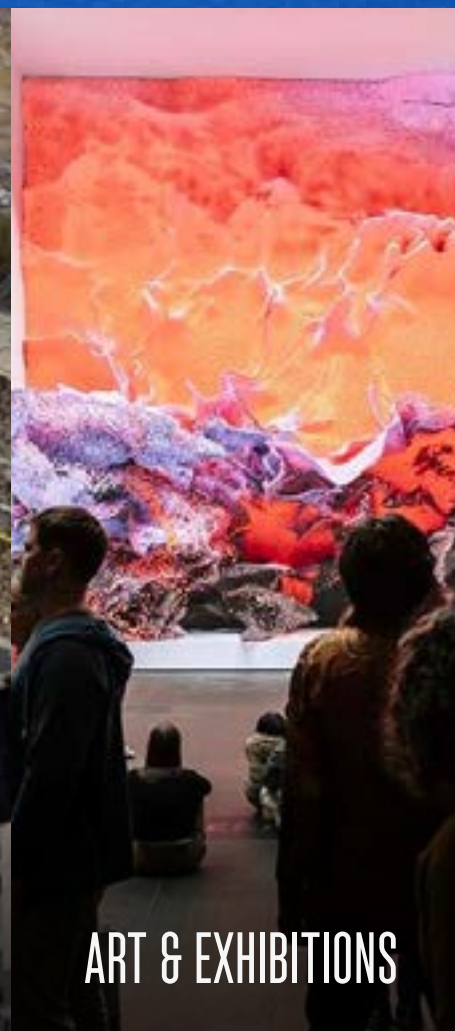
ART & EXHIBITIONS