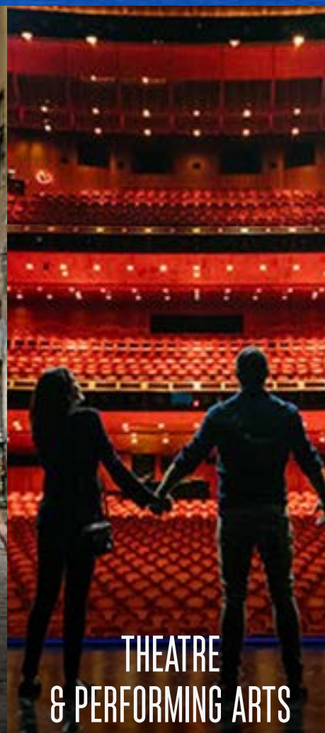
THEATRE & PERFORMING ARTS