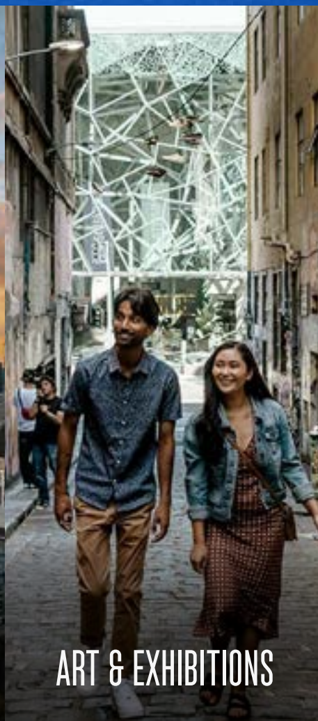
ART & EXHIBITIONS