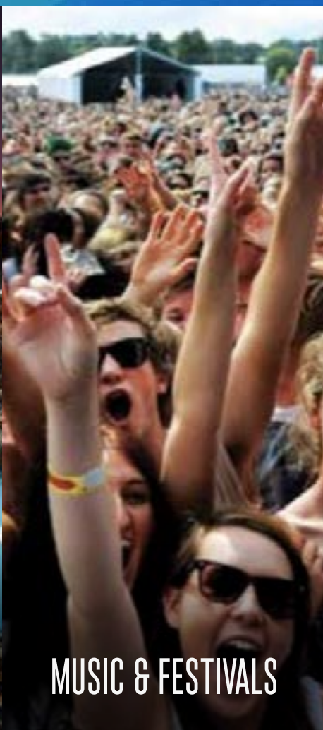
MUSIC & FESTIVALS