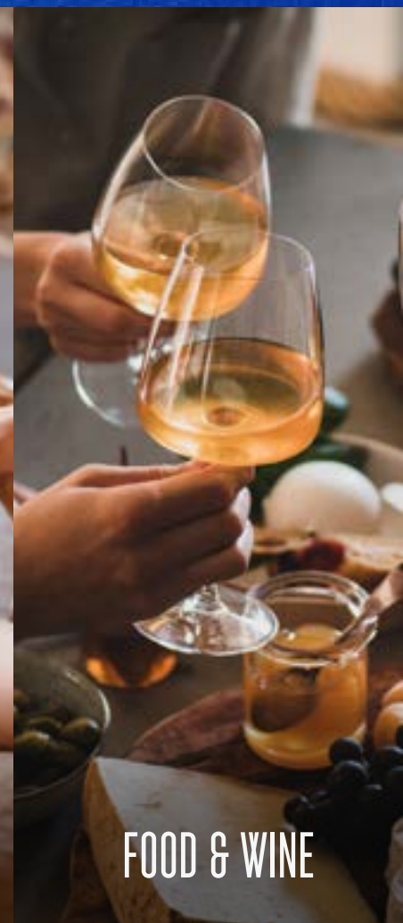
FOOD & WINE